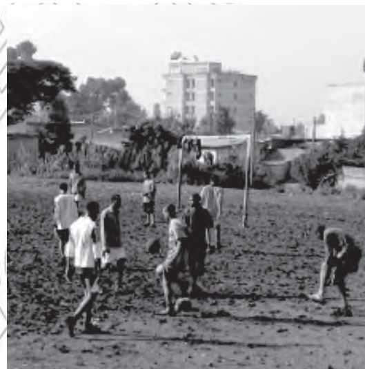
Playing football is one kind of leisure activity

Make a list of all the things you do during your leisure time. Classify those things into two columns. One column should include all the activities you do with your friends and family. The other all the activities you do by yourself. This shows your level of social interaction during your leisure time.