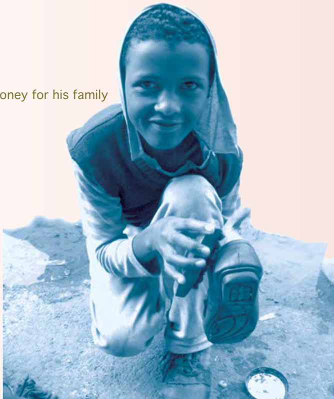
Shoeshine boy earning money for his family